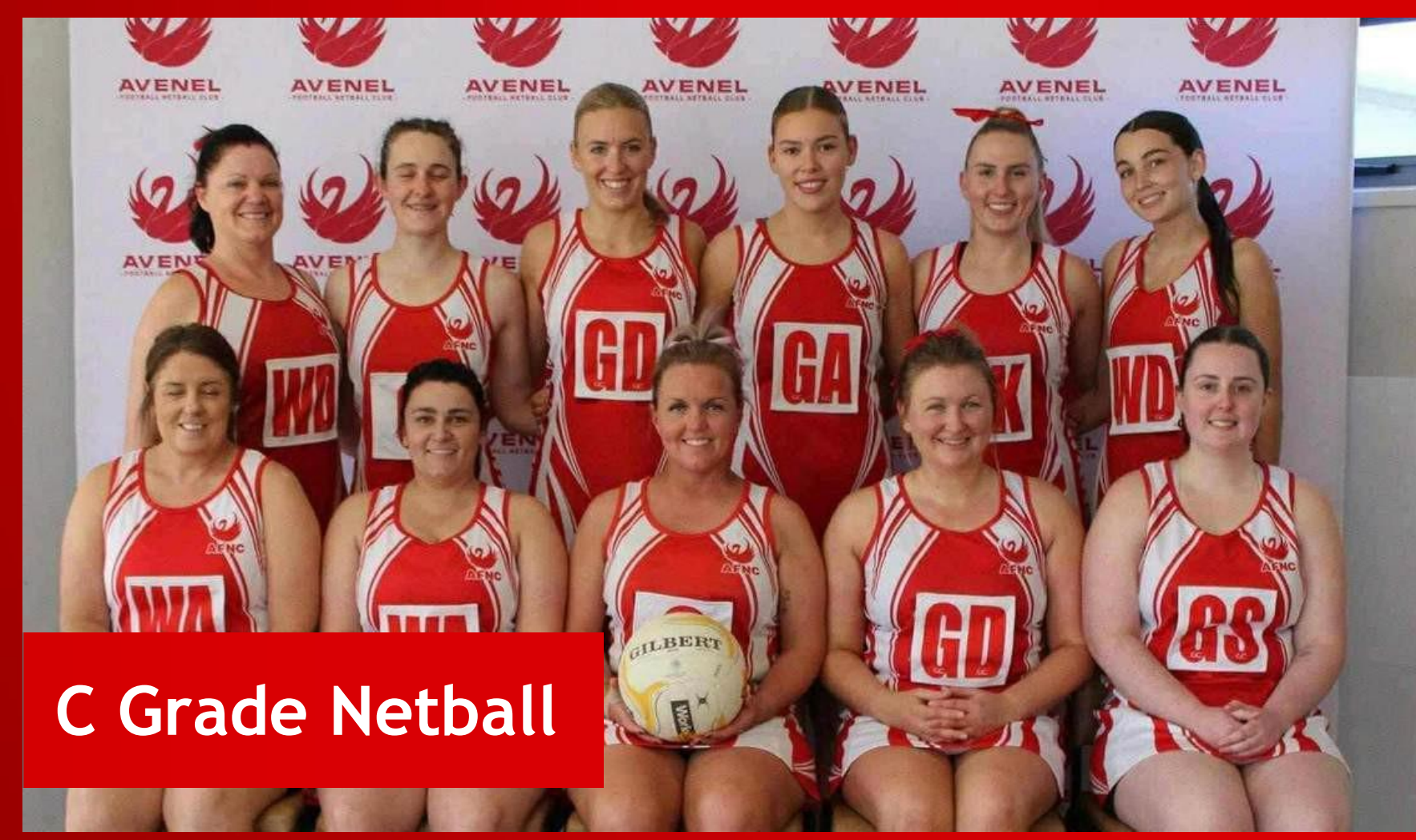
C Grade Netball