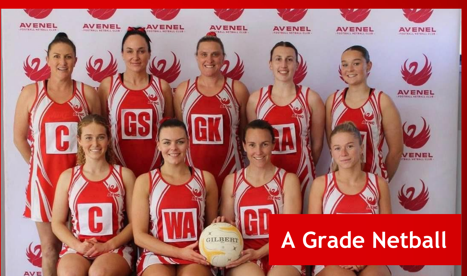
A Grade Netball