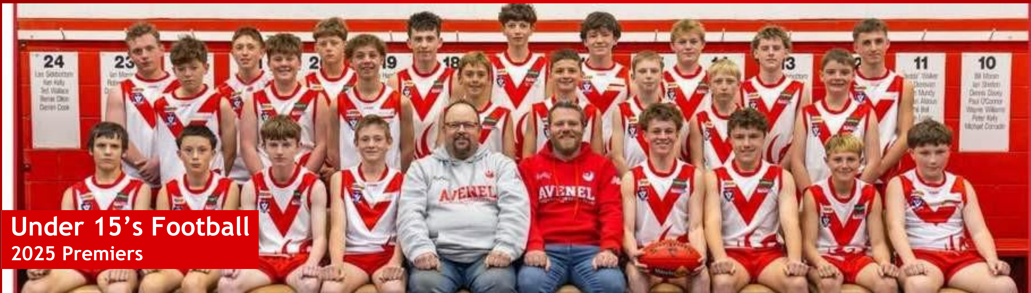
Under 15's Football 2025 Premiers