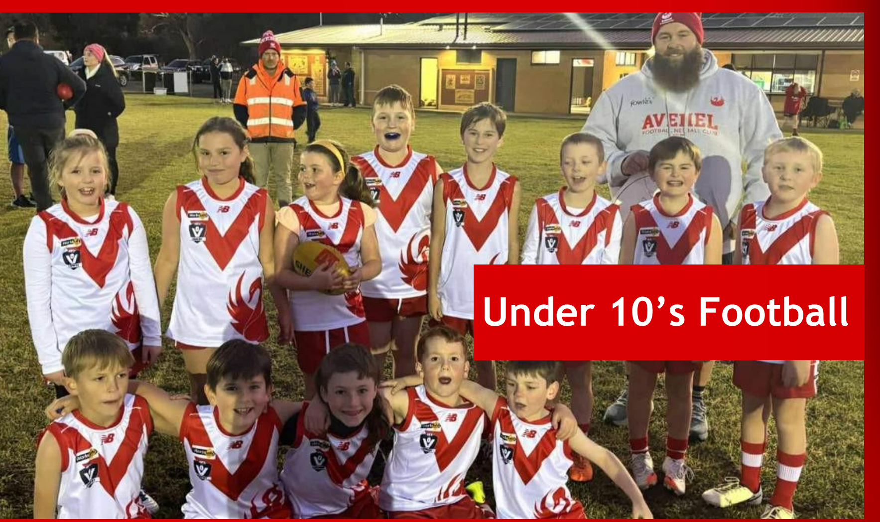
Under 10's Football